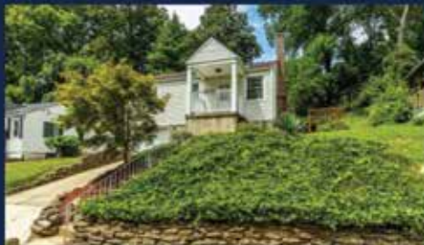
1733 Amsterdam Road, Fort Wright KY 2 Bed 1.5 Bath | $204,900