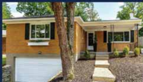
2783 Losantiridge Avenue, Cincinnati OH 3 Bed 3 Full Bath | $419,500