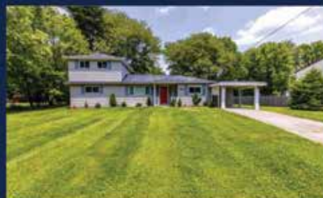
1382 Lela Lane, Milford OH 3 Bed 2 Full Bath | $314,900