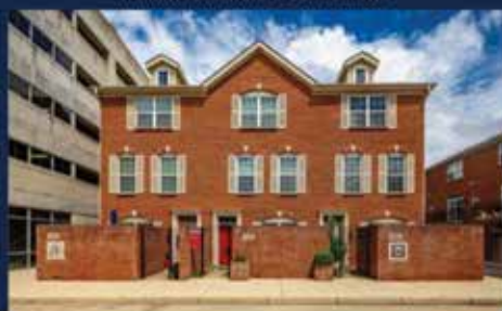
208 Harries Street, Dayton OH 2 Bed 1.5 Bath | $269,900