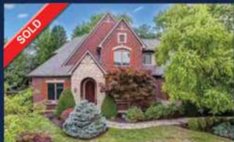
5047 Oakbrook Lane, Mason OH 4 Bed 5 Bath | $975,000