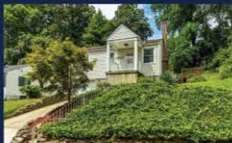
1733 Amsterdam Road, Fort Wright KY 2 Bed 1.5 Bath | $214,900