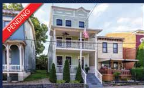
127 W 10 th Street, Covington KY 3 Bed 3.5 Bath | $545,000