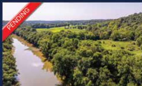
2891 Wagners Ferry Road, Falmouth KY 62 Acres | $325,000