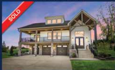
2400 Copper Ridge Court, Hebron KY 4 Bed 3.5 Bath | $990,000