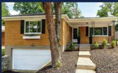
2783 Losantiridge Avenue, Cincinnati OH 3 Bed 3 Full Bath | $439,900